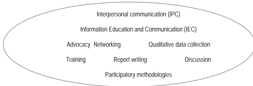
Diagram 1: Aspects of Communication Used by the Project

Diagram 2 below seeks to show the different aspects of communication in relation to the project supportogram.